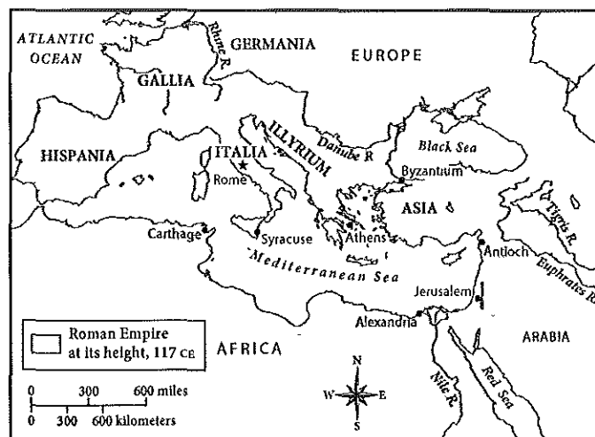
The Roman Empire at its height

Your task is to examine the documents in this Mini-Q and decide which three problems were most responsible for bringing Rome to its knees. Then, of these three problems, decide which was most important.