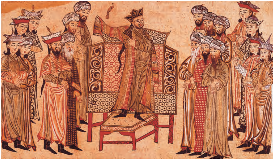
A fourteenth-century painting depicts the Turkish conqueror Mahmud of Ghazni as he dons a robe bestowed on him as a gift by the Abbasid caliph. Although Mahmud pursued independent policies, he always recognized the caliph as his overlord.

or Islamic shrines on the sites of Hindu and Buddhist structures that they destroyed. Not surprisingly, however, Mahmud's raids did not encourage Indians to turn to Islam.