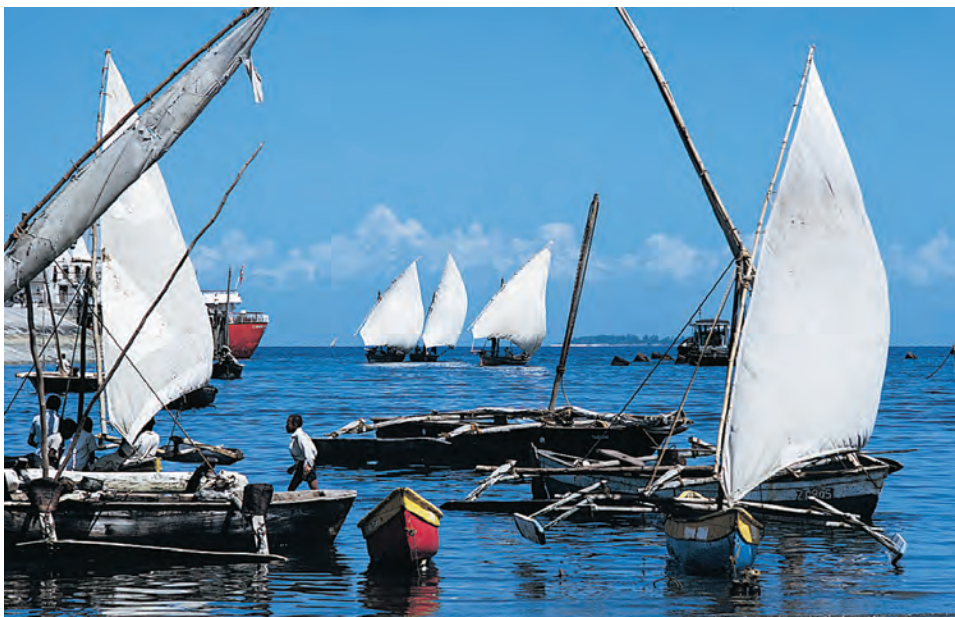
Dhows fitted with lateen sails skim across the Indian Ocean much like their ancestors of the postclassical era.

surged. Indian merchants and mariners sometimes traveled to distant lands in search of marketable goods, but the carrying trade between India and points west fell mostly into Arab and Persian hands. During the Song dynasty, Chinese junks also ventured into the western Indian Ocean and called at ports as far away as east Africa. In the Bay of Bengal and the China seas, Malay and Chinese vessels were most prominent.