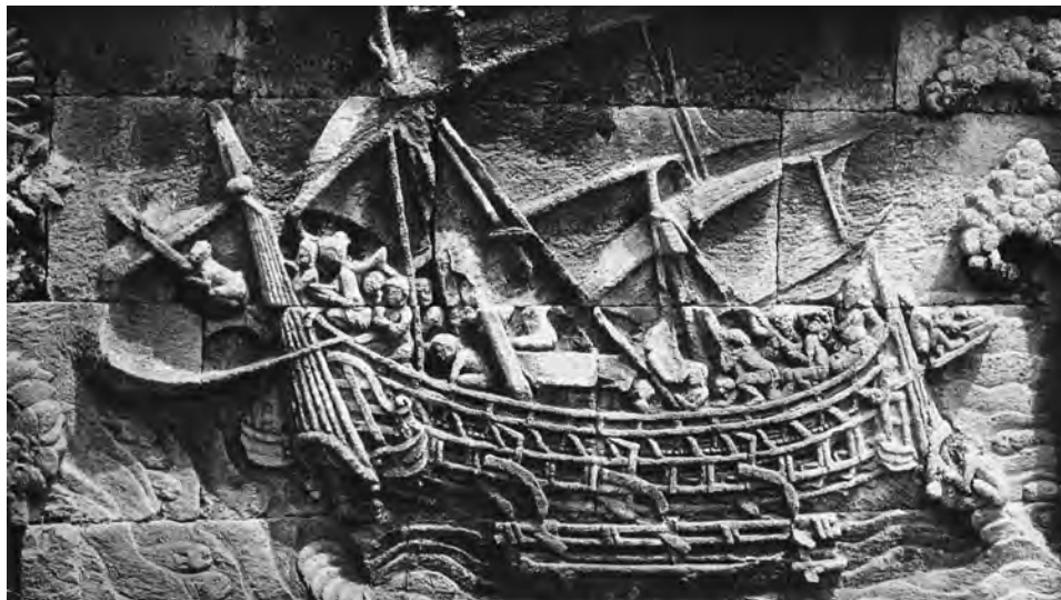
Maritime trade flourished in southeast Asia during postclassical times. This ninth-century relief carving from the Buddhist temple at Borobudur in Java depicts a typical southeast Asian ship.

As trade with India became an increasingly important part of Funan's economy, the ruling classes adopted Indian political, cultural, and religious traditions. They took the Sanskrit term raja ("king") for themselves and claimed divine sanction for their rule in the manner of Hindu rulers in India. They established positions for administrators and bureaucrats such as those found at Indian courts and conducted official business in Sanskrit. They introduced Indian ceremonies and rituals and worshiped Vishnu, Shiva, and other Hindu deities. They continued to honor local deities, particularly water spirits venerated widely throughout southeast Asia, but they eagerly welcomed Hinduism, which offered additional recognition and divine legitimacy for their rule. At first, Indian cultural and religious traditions were most prominent and most often observed at ruling courts. Over the longer term, however, those traditions extended well beyond ruling elites and won a secure place in southeast Asian society.