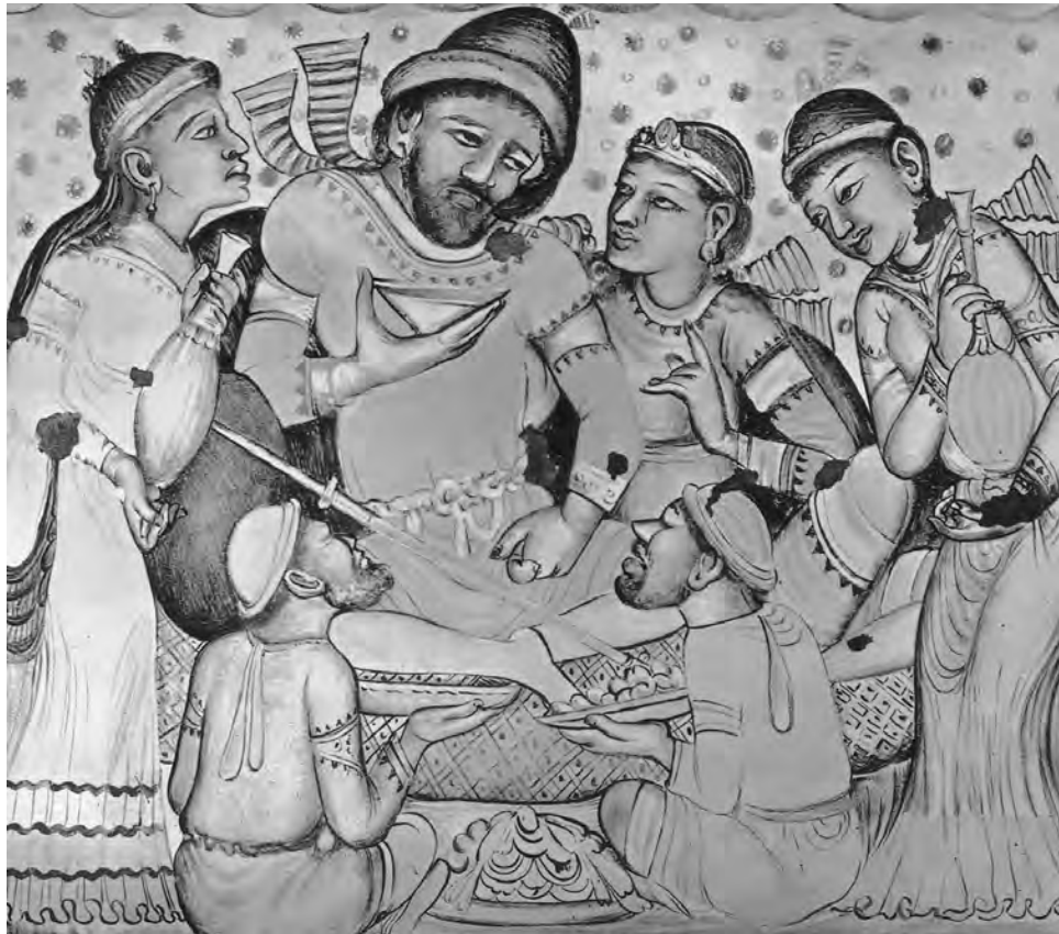
Mealtime for a Persian merchant and his two companions served by three women attendants in this ceiling decoration from the Ajanta caves in central India.