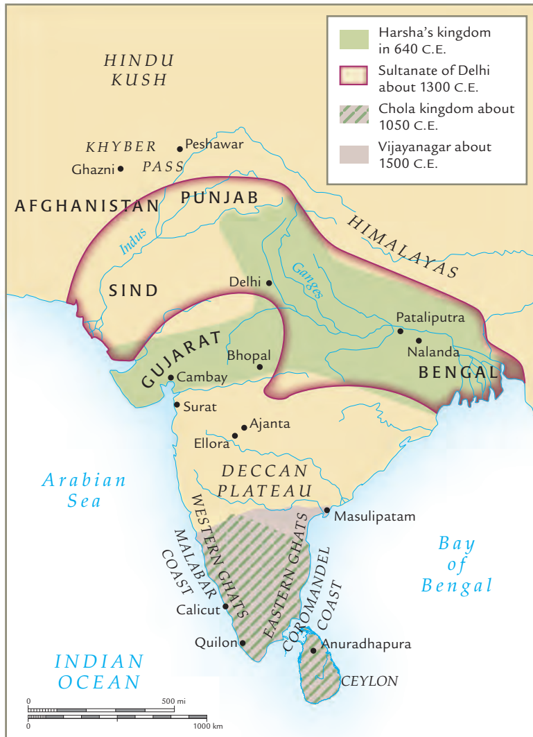
Map 16.1 Major states of postclassical India, 600–1600 c.e. Several large rivers and river valleys offered opportunities for inhabitants of northern India. How did peoples of southern India organize flourishing states and societies in the absence of major rivers?

army throughout northern India. His forces included twenty thousand cavalry, fifty thousand infantry, and five thousand war elephants, and by about 612 he had subdued those who refused to recognize his authority. He also made his presence felt beyond India. He extended his influence to several Himalayan states, and he exchanged a series of embassies with his contemporary, Emperor Tang Taizong of China.