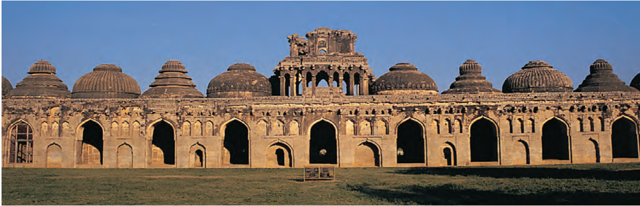
The kings of Vijayanagar endowed their capital with splendid buildings and even provided these handsome domed stables for their elephants.