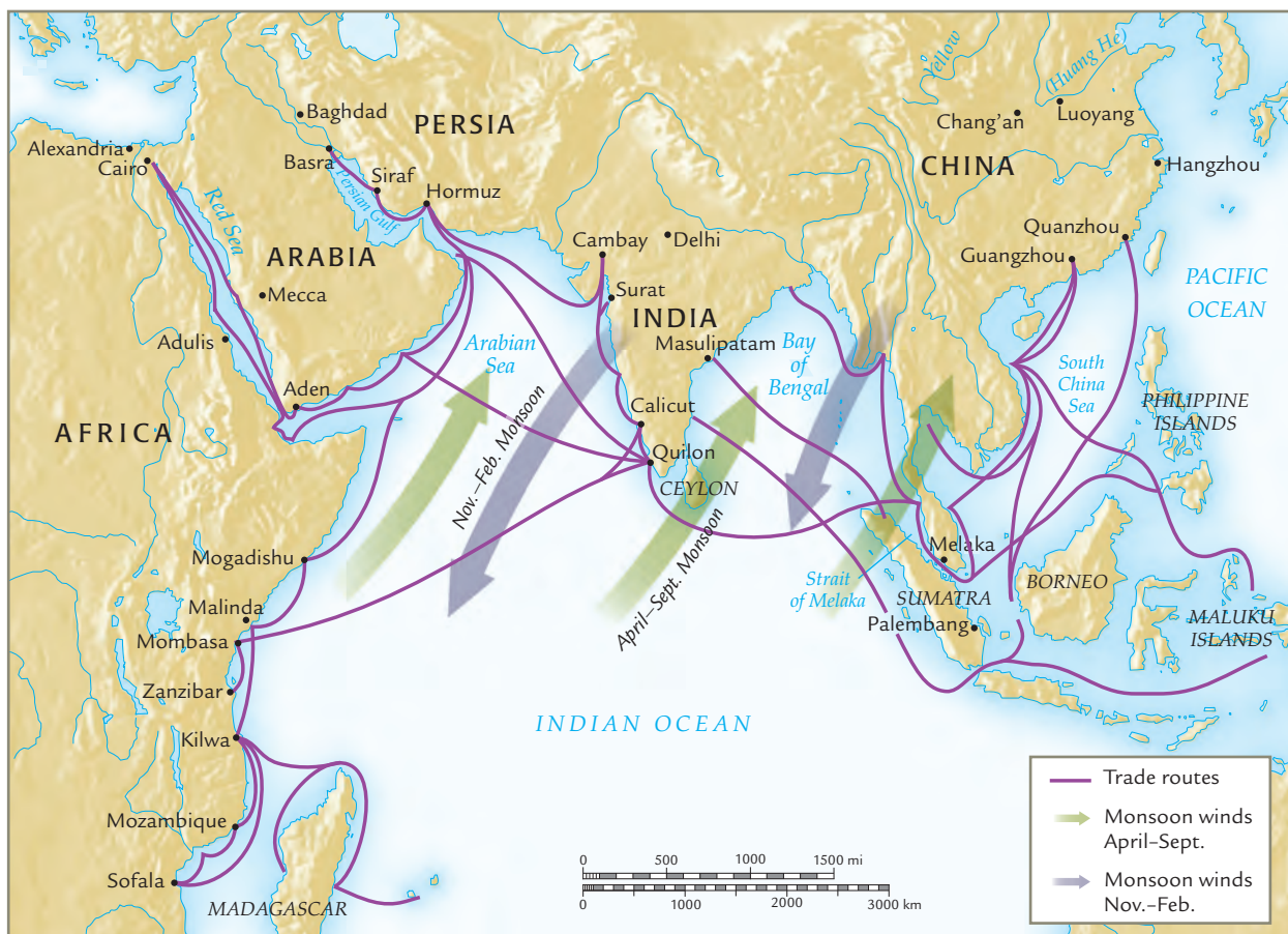
Map 16.2 The trading world of the Indian Ocean basin, 600–1600 C.E. Note the directions of seasonal winds in the Indian Ocean basin. How would mariners take advantage of these winds to reach their destinations?