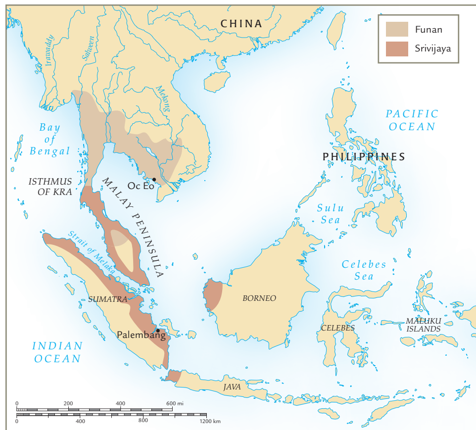
Map 16.3 Early states of southeast Asia: Funan and Srivijaya, 100–1025 c.e. Both Funan and Srivijaya relied heavily on maritime trade. To what extent were they able to take advantage of the trading networks shown on Map 16.2?

Meanwhile, southeast Asian ruling elites became acquainted with Indian political and cultural traditions. Without necessarily giving up their own traditions, they borrowed Indian forms of political organization and accepted Indian religious faiths. On