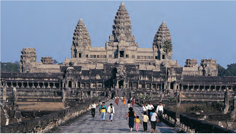
■ General view of the temple complex dedicated to Vishnu at Angkor Wat.

With the decline of Srivijaya, the kingdoms of Angkor (889–1431 C.E.), Singosari (1222–1292 C.E.), and Majapahit (1293–1520 C.E.) dominated affairs in southeast Asia. Many differences characterized these states. Funan had its base of operations in the Mekong valley, Srivijaya at Palembang in southern Sumatra, Angkor in Cambodia, and Singosari and Majapahit on the island of Java. Funan and Angkor were land-based states that derived most of their wealth from productive agricultural economies, whereas Srivijaya, Singosari, and Majapahit were island-based states that prospered because they controlled maritime trade. Funan and Majapahit were largely Hindu states, but the kings of Srivijaya and Angkor made deep commitments to Buddhism. Native southeast Asian traditions survived in all these states, and at the court of Singosari, religious authorities fashioned a cultural blend of Hindu, Buddhist, and indigenous values. Sculptures at the Singosari court depicted Hindu and Buddhist personalities, for example, but used them to honor local deities and natural spirits rather than Indian deities.