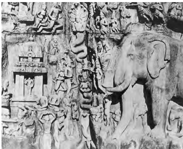
An elaborate open-air rock carving at Mamallapuram, south of modern Madras, celebrates the Ganges River as a gift from Shiva and other gods.

lengths to honor their chosen deities. Often cults originated when individuals identified Vishnu or Shiva with a local spirit or deity associated with a particular region or a prominent geographic feature. The famous cult of Shiva as lord of the dancers arose, for example, about the fifth or sixth century C.E. when devotees identified a stone long venerated locally in a southern Indian village as a symbol of Shiva. In the tenth century Chola kings took the dancing Shiva as their family god and spread the cult's popularity throughout southern India. By veneration