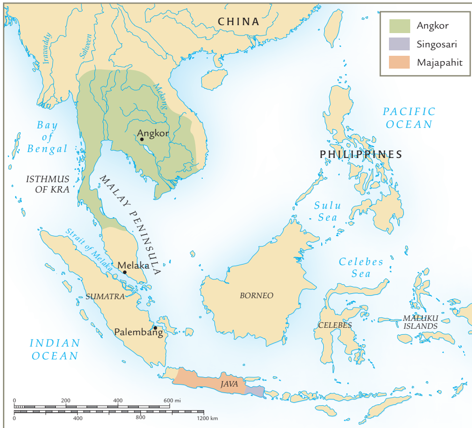
Map 16.4 Later states of southeast Asia: Angkor, Singosari, and Majapahit, 889–1520 C.E. Angkor was a largely agricultural society, whereas Singosari and Majapahit were more active in maritime trade. To what extent were these states able to take advantage of the trading networks shown on Map 16.2?

the model of Indian states, for example, they adopted kingship as the principal form of political authority. Regional kings in southeast Asia surrounded themselves with courts featuring administrators and rituals similar to those found in India.