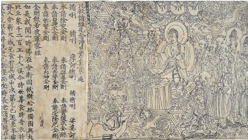
A printed book from the twelfth century presents a Chinese translation of a Buddhist text along with a block-printed illustration of the Buddha addressing his followers.

Quite apart from improving existing technologies, Tang and Song craftsmen also invented entirely new products, tools, and techniques, most notably gunpowder, printing, and naval technologies. Daoist alchemists discovered how to make gunpowder during the Tang dynasty, as they tested the properties of various experimental concoctions while seeking elixirs to prolong life. They soon learned that it was unwise to mix charcoal, saltpeter, sulphur, and arsenic, because the volatile compound often resulted in singed beards and even destroyed buildings. Military officials, however, recognized opportunity in the explosive mixture. By the mid-tenth century they were using gunpowder in bamboo “fire lances,” a kind of flamethrower, and by the eleventh century they had fashioned primitive bombs.