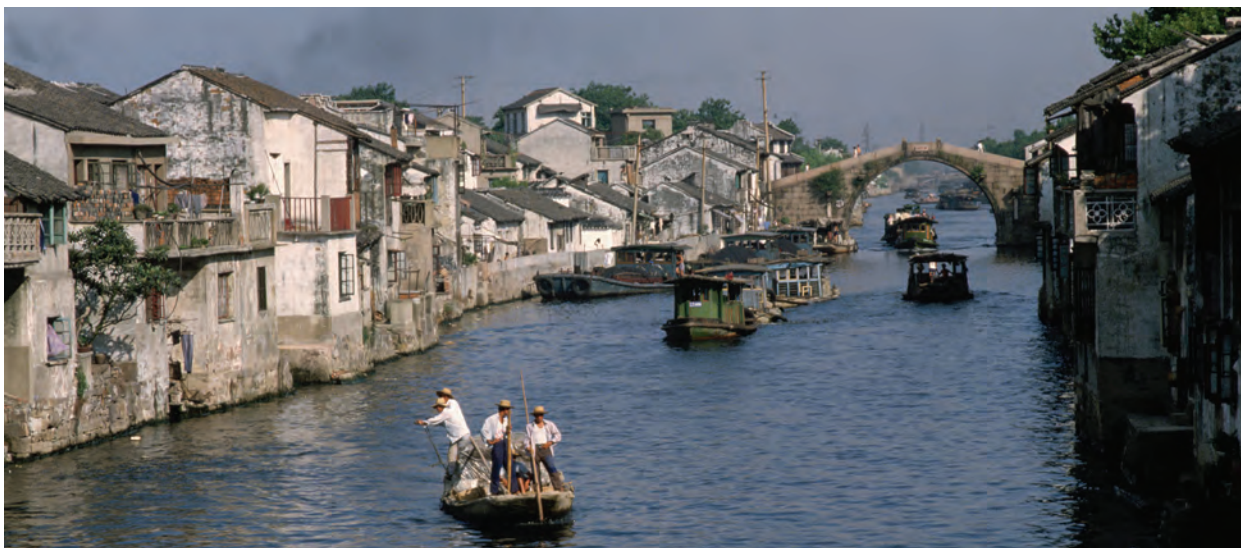
■ Barges make their way through a portion of the Grand Canal near the city of Wuxi in southern China.

reverses in Korea prompted discontented subjects to revolt against Sui rule. During the late 610s, rebellions broke out in northern China when Sui Yangdi sought additional resources for his Korean campaign. In 618 a disgruntled minister assassinated the emperor and brought the dynasty to an end.