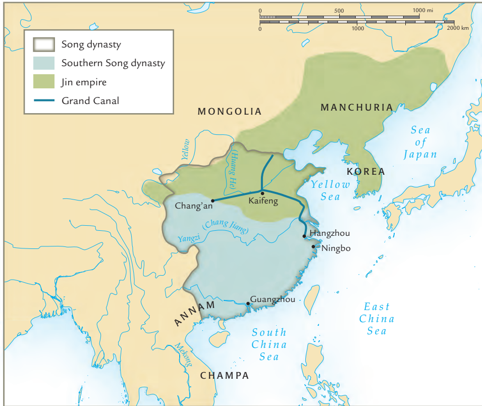
Map 15.2 The Song dynasty, 960–1279 C.E.

After the establishment of the Jin empire, the Song dynasty moved its capital from Kaifeng to Hangzhou. What advantages did Hangzhou offer to the Song rulers?