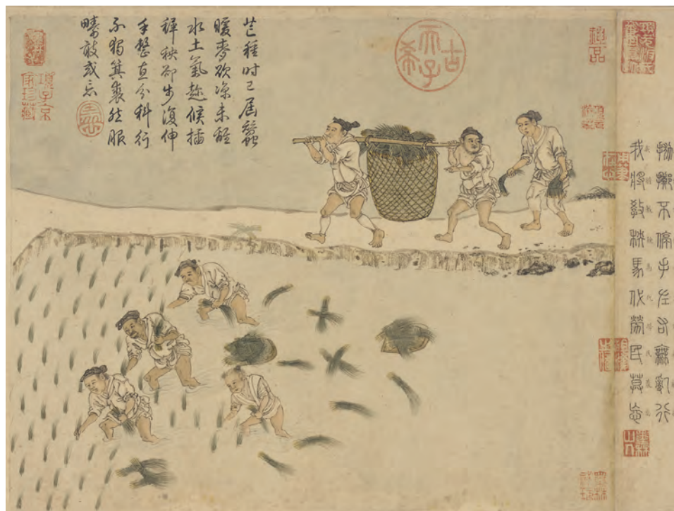
An illustration commissioned by the Song government shows peasants how to go about the laborious task of transplanting rice seedlings into a paddy flooded with water.