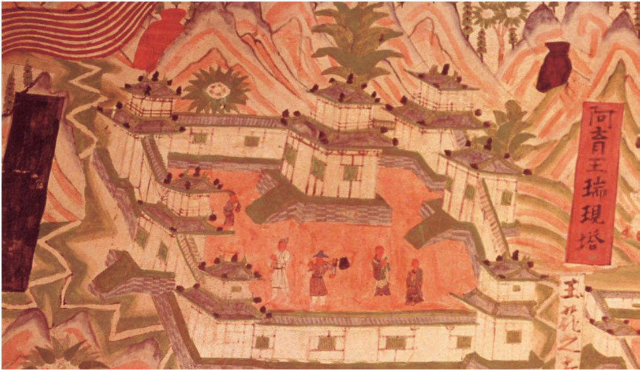
A tenth-century painting in a cave at Dunhuang depicts a monastery on Mt. Wutai in southern China, reputedly the earthly home of an influential bodhisattva and the site of numerous Buddhist monasteries.

even had implications for everyday life in China. Buddhist monks introduced chairs into China: originally a piece of monastic furniture, the chair quickly became popular in secular society and found a place in domestic interiors throughout the land. Buddhist monks also introduced refined sugar into China and thus influenced both diet and cuisine.