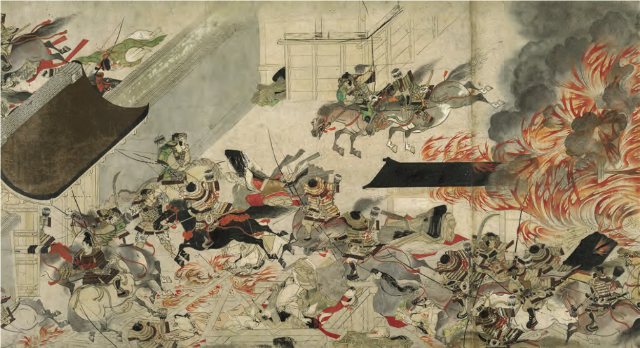
Samurai depart from a palace in Kyoto after capturing it, murdering the guards, seizing an enemy general there, and setting the structure ablaze. The armor and weaponry of the samurai bespeak the militarism of the Kamakura era.

Because Japanese women rarely received a formal Chinese-style education, in Heian times aristocratic women made the most notable contributions to literature in the Japanese language. Of the many literary works that have survived from this era, none reflects Heian court life better than The Tale of Genji . Composed by Murasaki Shikibu, a lady-in-waiting at the Heian court who wrote in Japanese syllabic script rather than Chinese characters, this sophisticated work relates the experiences of a fictitious imperial prince named Genji. Living amid gardens and palaces, Genji and his friends devoted themselves to the cultivation of an ultrarefined lifestyle, and they became adept at mixing subtle perfumes, composing splendid verses in fine calligraphic hand, and wooing sophisticated women.