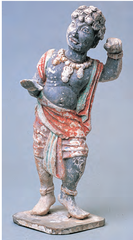
Tang dynasty pottery figure of a Vietnamese dancer. Commercial and tributary relationships introduced southeast Asian performers to China, where sophisticated urban communities appreciated their exotic entertainment.

Chinese armies never invaded Japan, but Chinese traditions deeply influenced Japanese political and cultural development. The earliest inhabitants of Japan were nomadic peoples from northeast Asia who migrated to Japan about thirty-five thousand