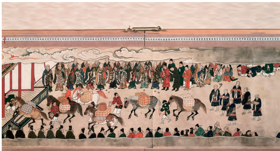
This scroll painting depicts the return of the monk Xuanzang to China. His baggage included 657 books, mostly Buddhist treatises but also a few works on grammar and logic, as well as hundreds of relics and images.

and the observance of celibacy, they also recognized the validity of family life and offered Buddhism as a religion that would benefit the extended Chinese family: one son in the monastery, they taught, would bring salvation for ten generations of his kin.