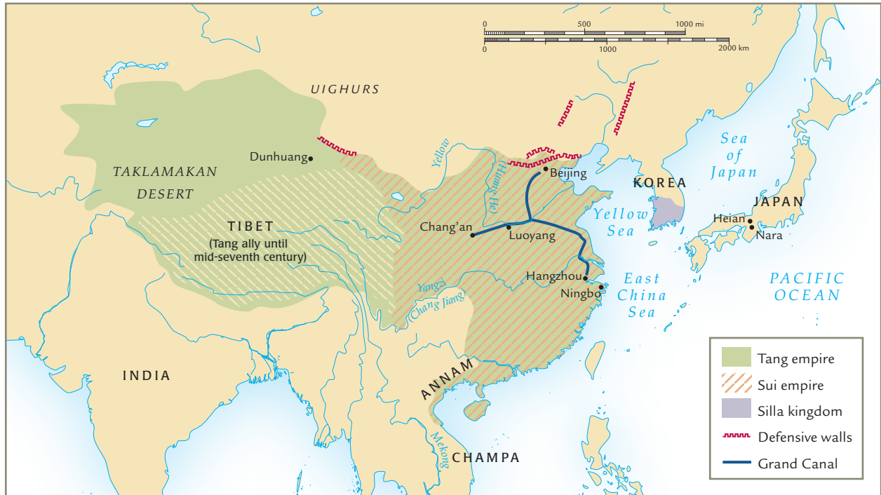
Map 15.1 The Sui and Tang dynasties, 589–907 C.E. Compare the size of the Sui and Tang empires. Why was the Tang dynasty able to extend its authority over such vast distances? Discuss the significance of the Grand Canal in linking the various regions of China.

The most elaborate project undertaken during the Sui dynasty was the construction of the Grand Canal, which was one of the world's largest waterworks projects before modern times. The second emperor, Sui Yangdi (reigned 604–618 C.E.), completed work on the canal to facilitate trade between northern and southern China, particularly to make the abundant supplies of rice and other food crops from the Yangzi River valley available to residents of northern regions. The only practical and economical way to transport food crops in large quantities was by water. But since Chinese rivers generally flow from west to east, only an artificial waterway could support a large volume of trade between north and south.