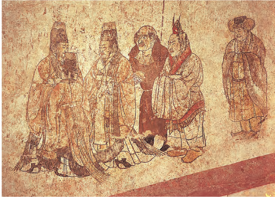
In this wall painting from the tomb of a Tang prince, three Chinese officials (at left) receive envoys from foreign lands who pay their respects to representatives of the Middle Kingdom. The envoys probably come from the Byzantine empire, Korea, and Siberia.

would perform the kowtow—a ritual prostration in which subordinates knelt before the emperor and touched their foreheads to the ground. In return, tributary states received confirmation of their authority as well as lavish gifts. Because Chinese authorities often had little real influence in these supposedly subordinate lands, there was always something of a fictional quality to the system. Nevertheless, it was extremely important throughout east Asia and central Asia because it institutionalized relations between China and neighboring lands, fostering trade and cultural exchanges as well as diplomatic contacts.