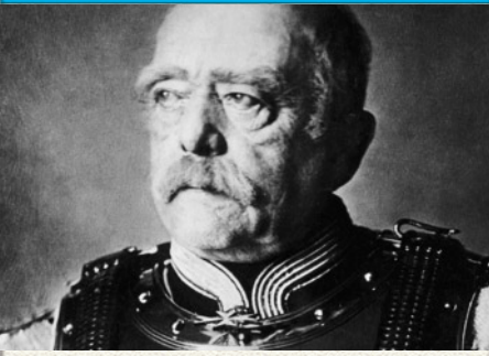
Otto von Bismarck 1815–1898

To some Germans, Bismarck was the greatest and noblest of Germany's statesmen. They say he almost single-handedly unified the nation and raised it to greatness. To others, he was nothing but a devious politician who abused his powers and led Germany into dictatorship.