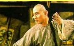
MANCHUS in CHINA