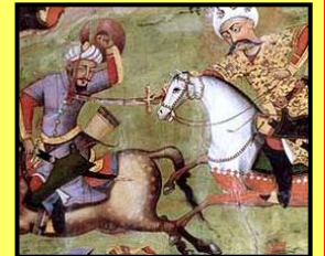
OTTOM vs. SAFAV. (MIDDLE EAST)