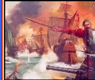
OTTOMAN v. EURO