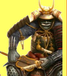
SAMURAI REVOLTS (JAPAN)