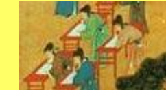
CHI. CIV. SER. EXAM