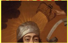
DIVINE RIGHT (EUR)