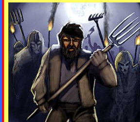
PEASANT UPRISINGS (EUROPE)