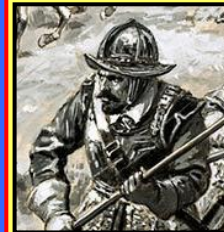
30 YEARS WAR (EUROPE)